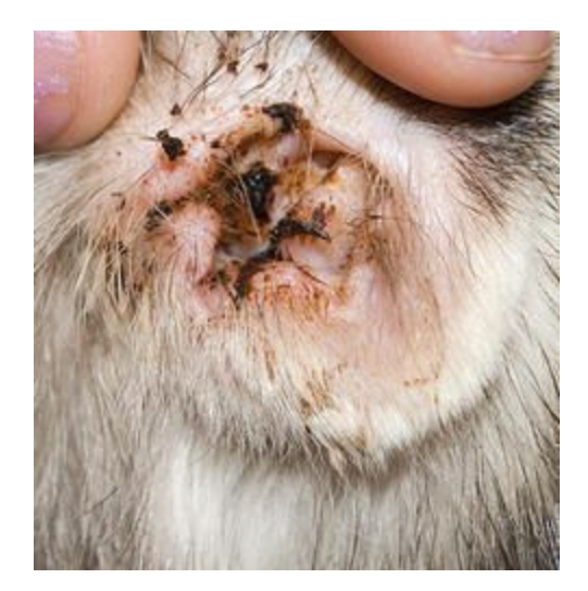
Ear Mites in the ear canal

https://www.lovethatpet.com/dogs/grooming/cleaning-your-dogs-ears/ http://happypetsinfo.com/blog/wp-content/uploads/2016/12/Happy-Pets-Blog-Cat-Ear-Care-3.jpg